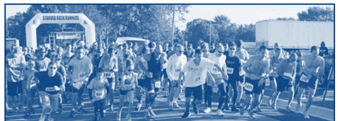
The race started bright and early at 8 a.m. Saturday, September 2